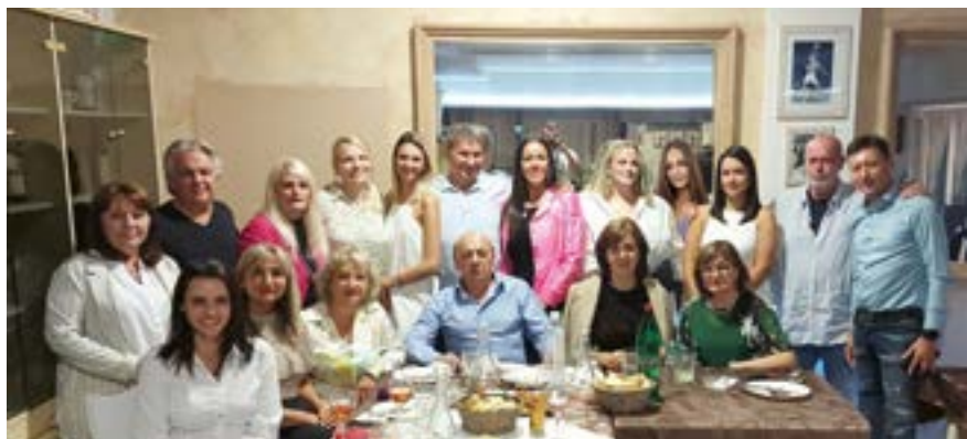
The organizing team of the 4-day congress.